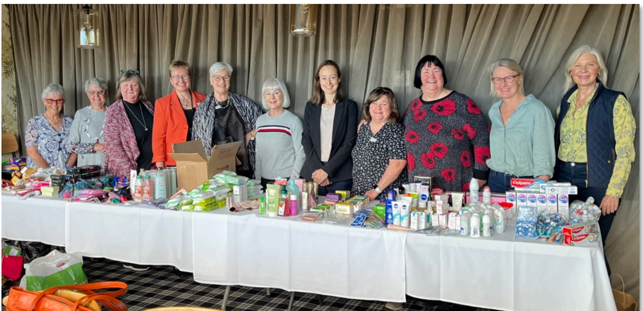
Club members preparing Christmas "Bags of Love"