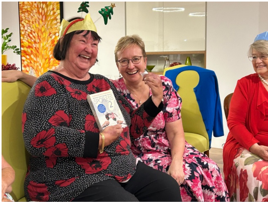
The Zonta Club of Adelaide Torrens and supporters celebrating a very successful Zonta year and enjoying Christmas dinner and wonderful fellowship!