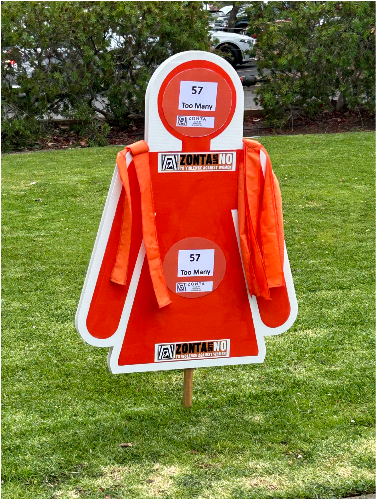
Our Orange Lady outside the Burnside Community Centre