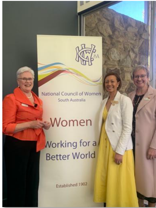
Attending the 120th Anniversary luncheon of National Council of Women – SA